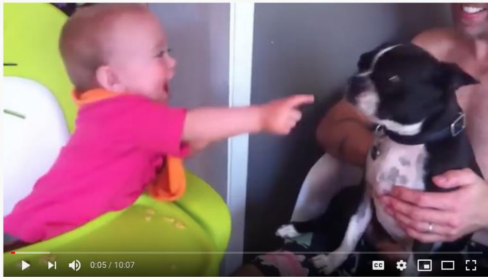
#puppies #puppiesandbabies #cutepuppiesandbabiesplayingtogethercompilation Cute Puppies and Babies Playing Together Compilation 2019