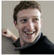
Facebook founder Mark Zuckerberg.

Mark Zuckerberg, 23, founded Facebook while studying psychology at Harvard University. A keen computer programmer, Mr Zuckerberg had already developed a number of social-networking websites for fellow students, including Coursematch, which allowed users to view people taking their degree, and Facemash, where you could rate people's attractiveness.